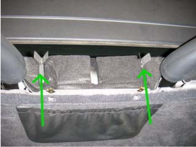
It is held by two hooks between the roll bars.