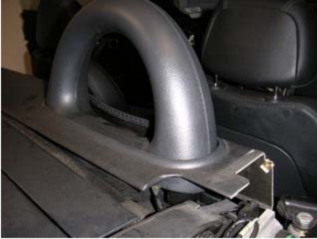
Lift it up carefully.