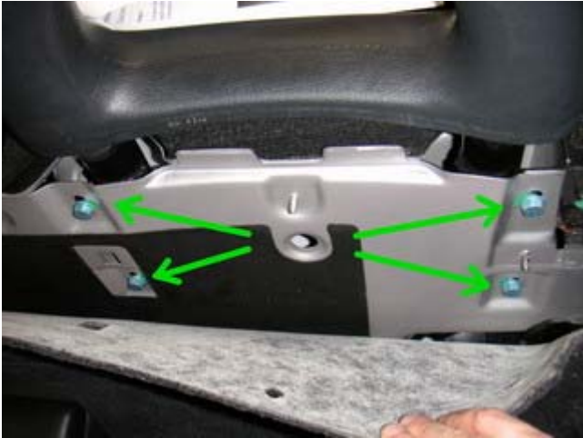
As soon as we have removed the liner, we will have access to the roll bar bolts behind the cabing wall carpet.